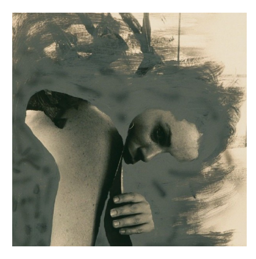
Ellen Carey, Self-Portrait, 1978, gelatin silver print with acrylic.

Ellen Carey is an American artist whose main medium is photography. She later distorts or enhances these pieces to convey a message, which she does with other mediums such as acrylic paint and collage.