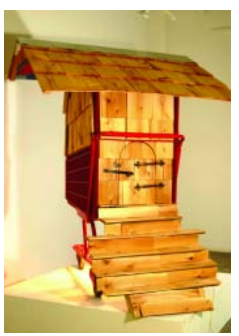
RV, 2008, cedar, grocery cart, office panels, wood, 36 \times 36 \times 72 in.

When unrestricted by rigid predetermined goals, I create form, theme and context for my work. The work that r esults from this is a reflection of my personal experiences both past, present and sometimes future. These experiences are transported and transformed into a visual vocabular y, recognizable not only to me, but to the viewer. The viewer may be intrigued not only by the peculiarity and unfamiliarity of what they see, but may also be drawn in by the r ecognition of commonality that weaves itself throughout my work.