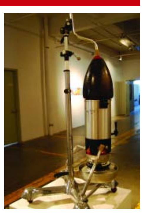
Coffee Bomb, found object, steel, 2 x 2 x 5 ft.