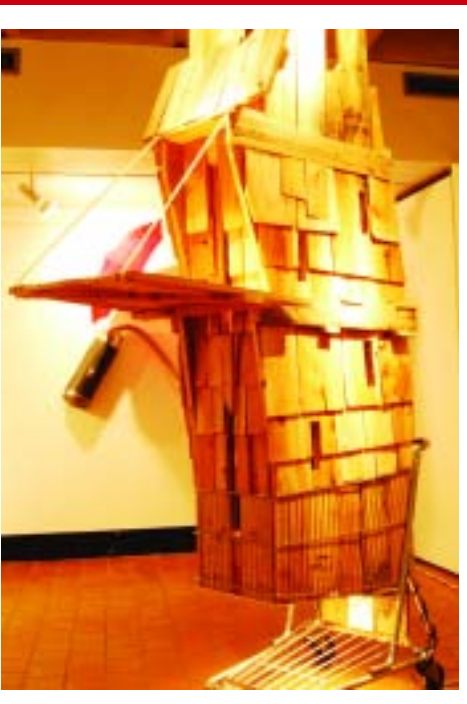
Salvation Armory, 2009, cedar, grocery cart, wood. 18 \times 30 \times 98 in.