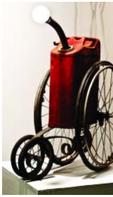
Gas Tractor, 2007, gas can, wheel chair wheels, steel table legs, 32 x 12 x 34 in.