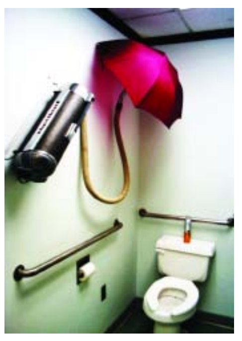
Global Warming, 2008, commercial vacuum, umbrella, 12 \times 24 \times 48 in.