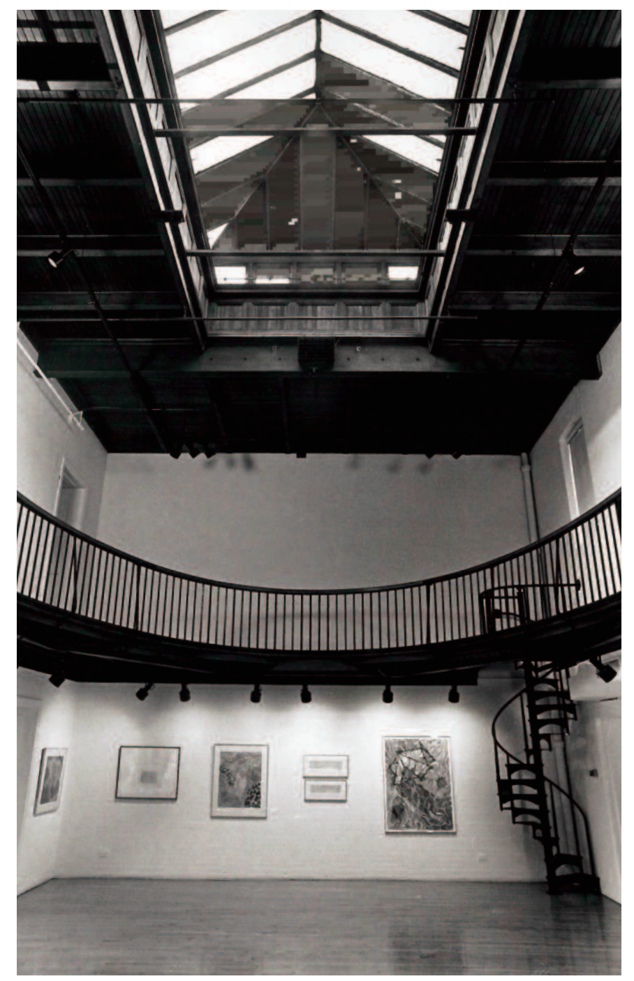
Interior documentation of the gallery located at 560 Franklin Street (Carriage House).