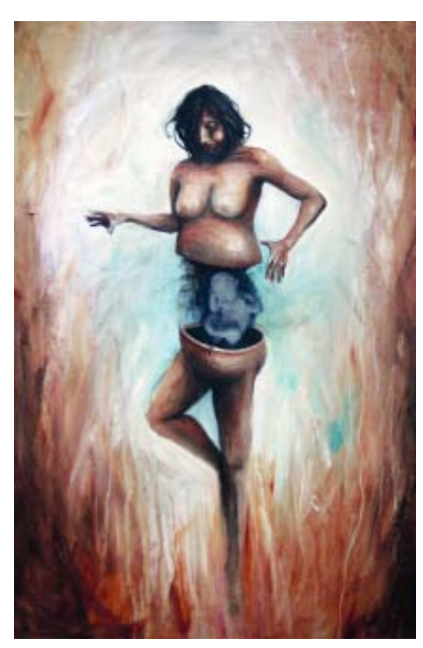
Precious Cargo, 2011, acrylic on board, 20 x 30 in.