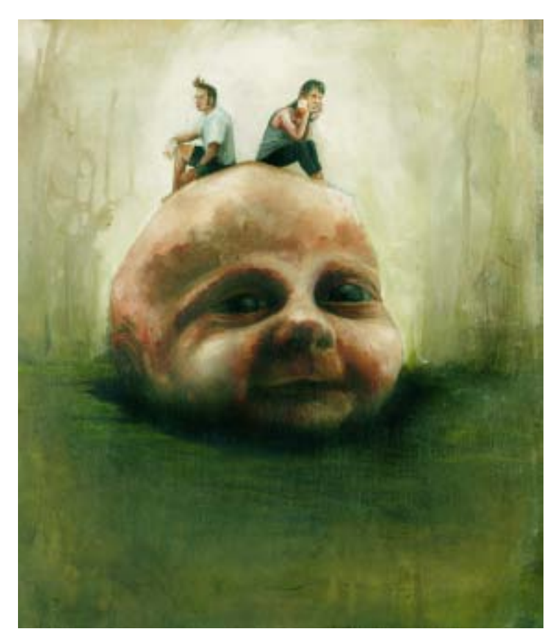
Headup, 2011, acrylic on wood, 12 x 14 in.