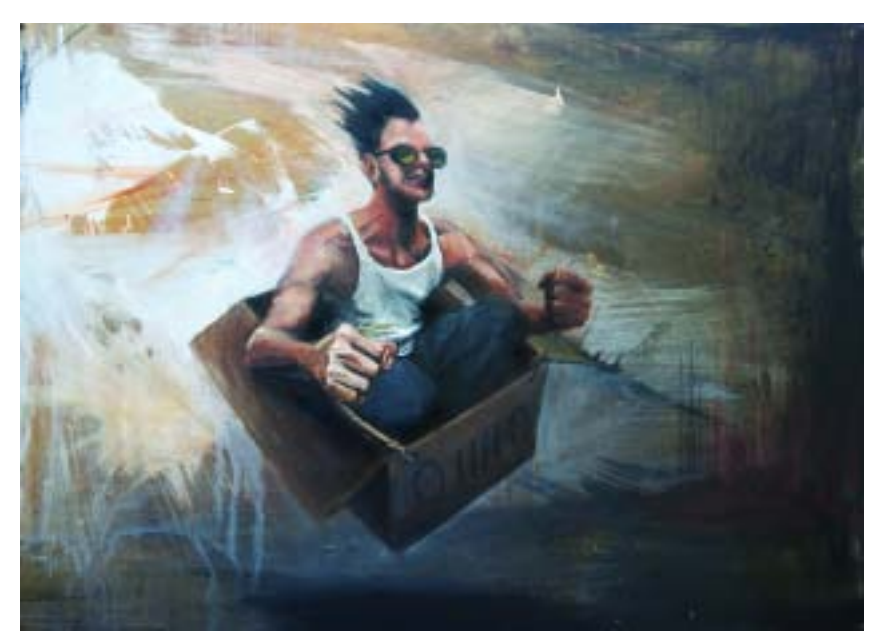
Prepare for Impact, 2009, acrylic on canvas, 20 x 30 in.