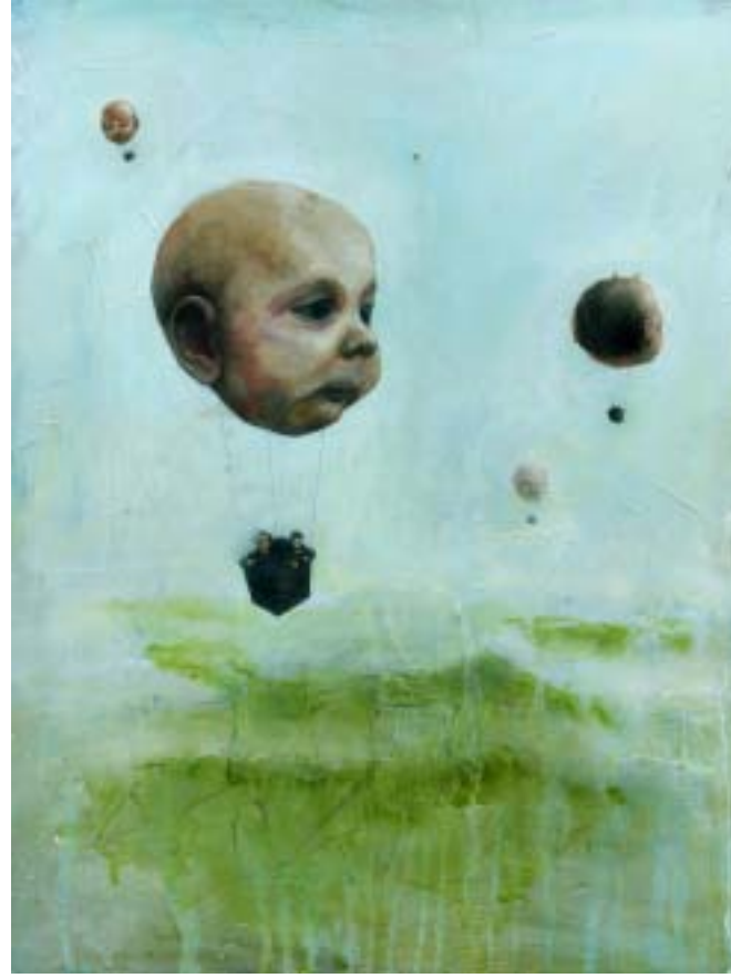
Lofty Dreams, 2009, mixed media, 13 x 10 in.