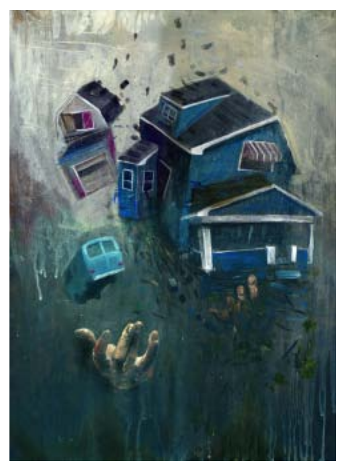
A House is House for Me, 2010, acrylic on board, 15 x 20 in.

A vessel of storage can include the physical attributes of one's being. Duquette states, "an individual is a holder of material and non-material commodities." He or she becomes a vessel of experiences and memories. Expressed in Domestic (2011), the artist symbolizes this through the myriad of drawers within the figure's body, inferring that opening a draw is like r eliving