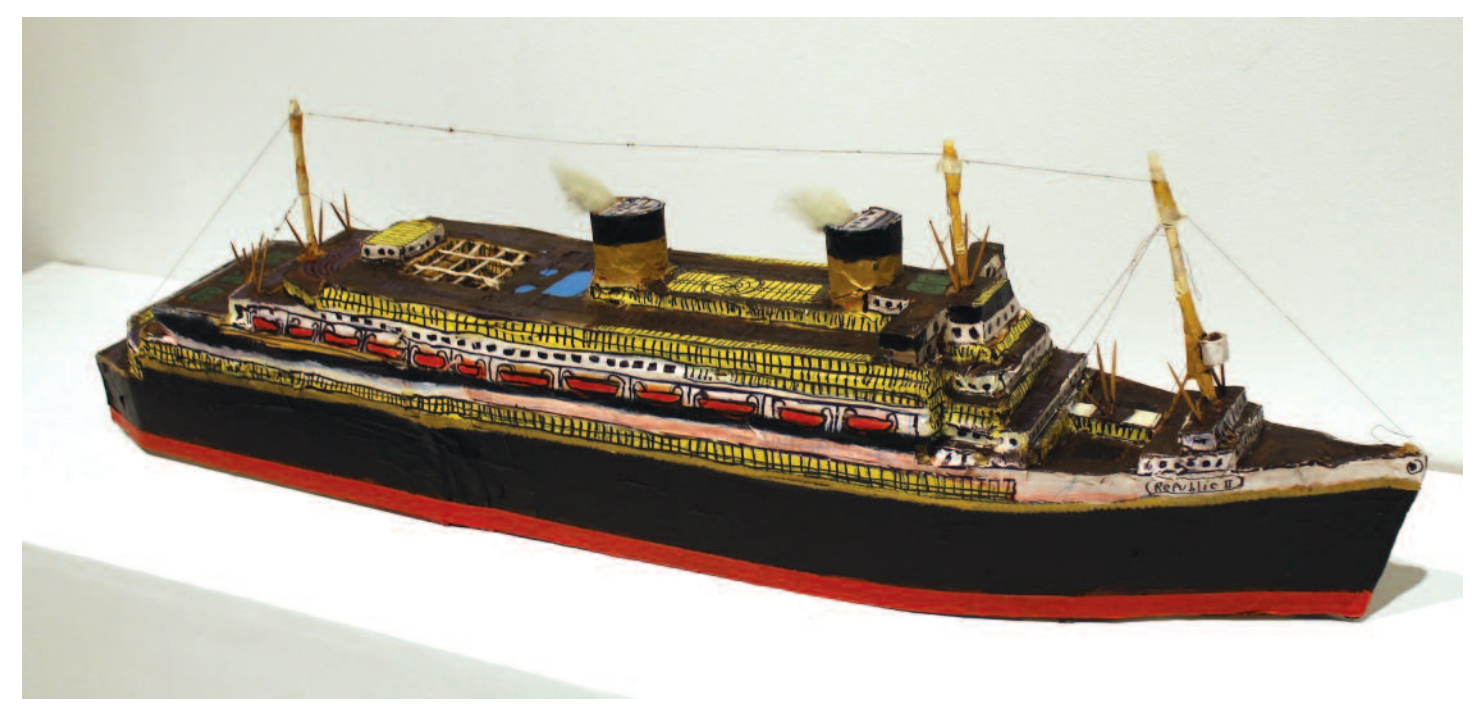
Republic II, 1998, 46 x 8 x 13 in.