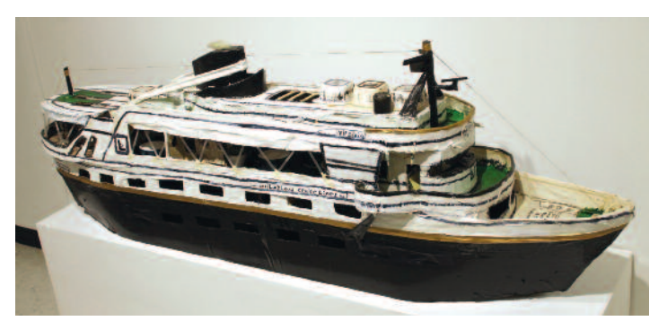
Virginia, 2002, 74 x 13 x 26 in.