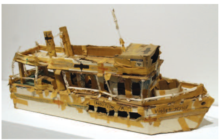
Violet Jessop, (ex. Saturn I), (Museum Ship), 1997, 39 x 11 x 17 in.