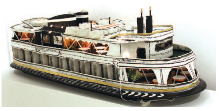
Australia, (illuminated), 2017, 67 x 25 x 24 in.

Gerald Mead, Independent Curator & Art Collector