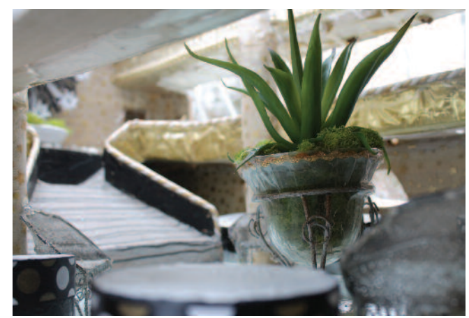
Universe II (detail: interior - Galaxy Dining Hall), 2003/2017, 134 x 22 x 28 in.