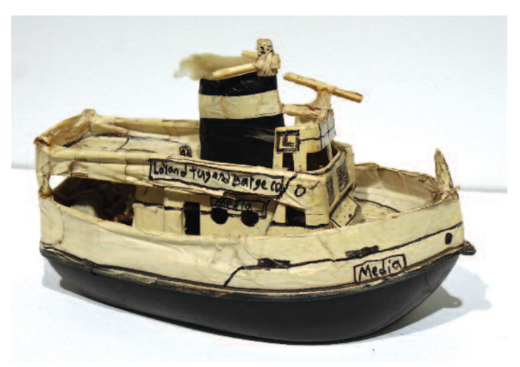
Media, 1996, 15 x 9 x 10 in.