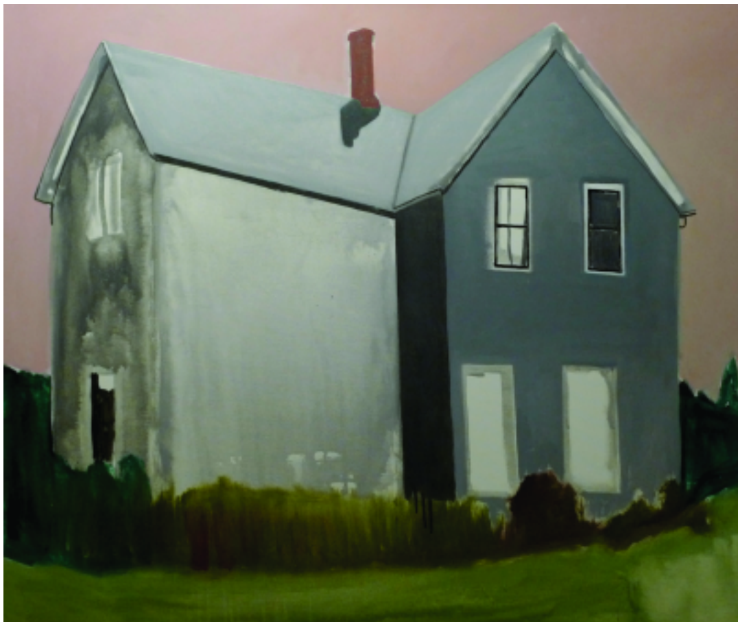
South 626 Four Rod Rd., Oct. 1974 (first rendition), 2009, Acrylic on canvas, 48 x 40 inches

Woven into simple visual narratives using words and pictures from a laundry list of sources, these works are often injected with the absurd and surreal, heavily influenced by graphic design work I do by day and comic books I have read voraciously throughout the years. With directed paint drips, written and then obscured notations, cartoon bubbles, viscera, muted voices, and incomplete thoughts, I make assumptions. With an infusion of nostalgia, confusion, and longing, I extrapolate a story from morsels of truth—so that it might become something else entirely.