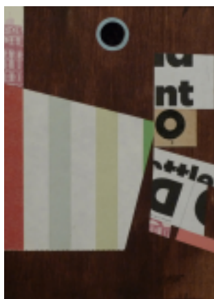
Don't Settle, 2008 Mixed media, 5.5 x 7.5 inches

Michael Beam Curator of Exhibitions and Collections