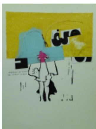
Insomnia, 2008 Mixed media, 15.5 x 14.25 inches