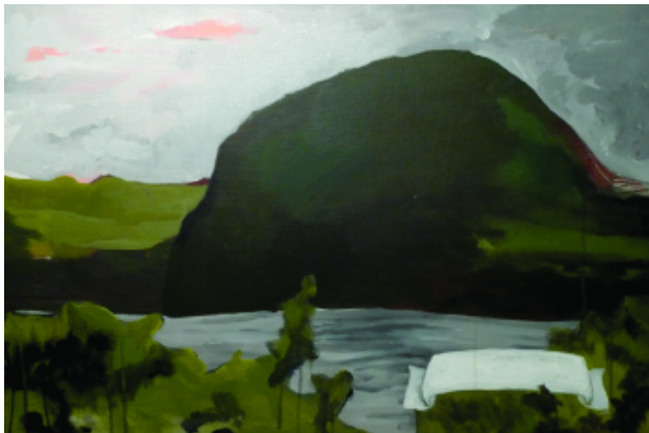
The Strange Hill in the Hudson I, 2008, Acrylic on canvas, 40 x 24 inches

The paintings Lady Godiva's Operation (2008) and The Fetch (2008) function as doppelgangers of sorts. At first, appearing as a double portrait, these works respond to each other more as a reflection or peripheral vision. Doppelgangers