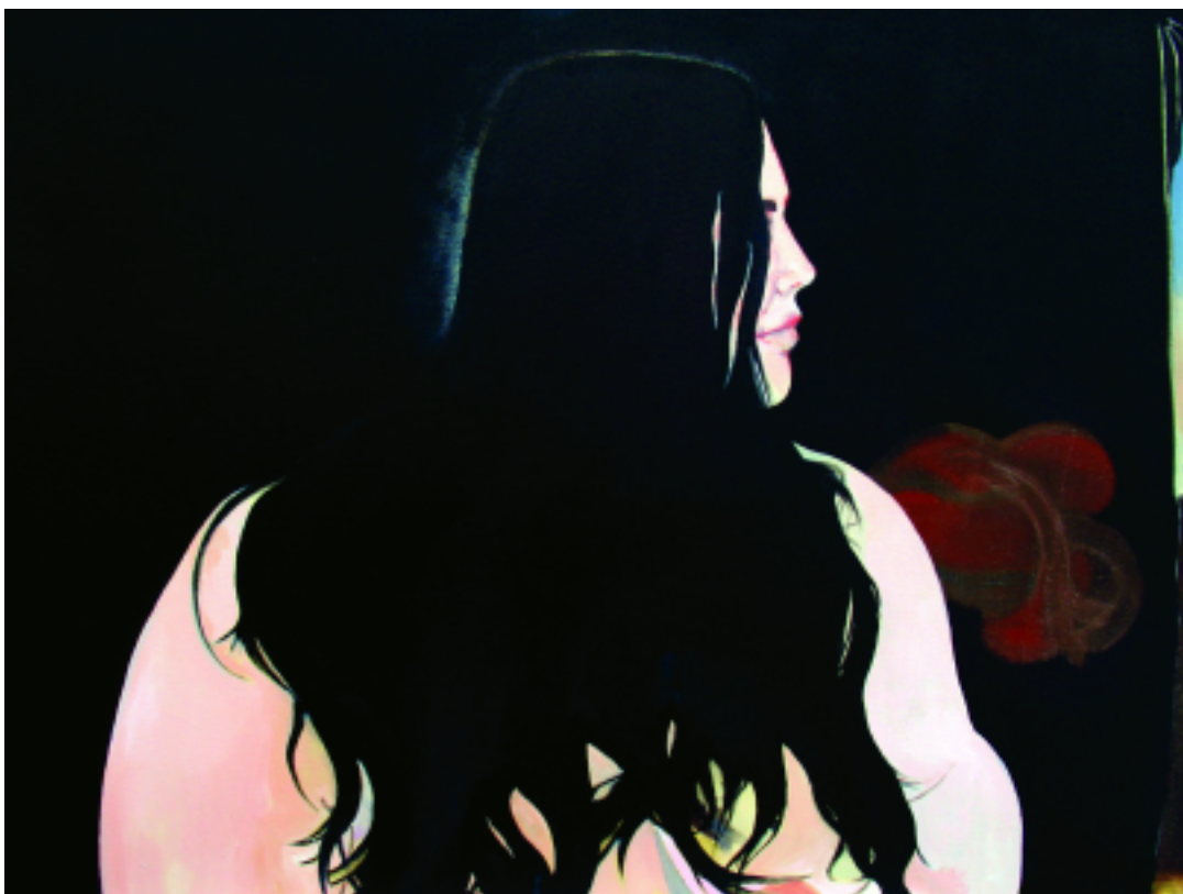
Lady Godiva's Operation, 2008, Acrylic on canvas, 42 x 30 inches