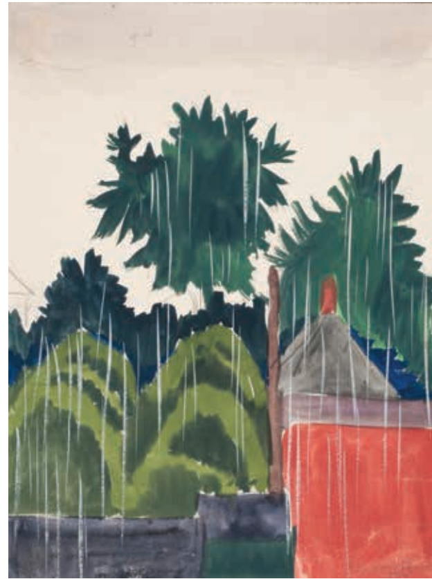
Charles Burchfield, Untitled , 1916, watercolor on paper

Cover: Alice Baber, Blue Turns Beyond Blue , 1977, watercolor on paper