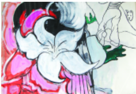
Flower, Boy, Dog , 1987, acrylic on paper, 25 x 33 in.