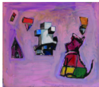
Thinking Dog , 1987, acrylic on paper, 30 x 33½ in.