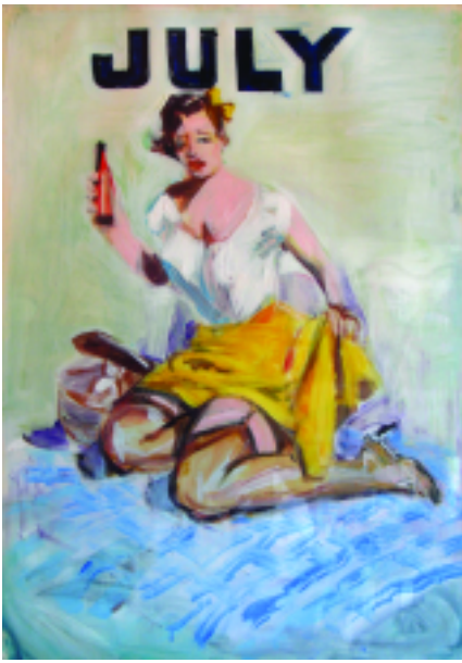
July: The Spilled Ketchup , 1997, acrylic on paper, 43 x 31 in.