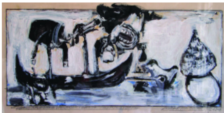
(Rube) Goldberg Variation: Canoe Propulsion , 1992+2005, acrylic & pencil on paper, 25 x 33 in.

The cartoons evolved into overtly satirical work with the (Rube) Goldberg Variations . Rube Goldberg (1883-1970) was a Pulitzer Prize-winning cartoonist, a sculptor, and a writer whose famous "inventions" depicted fantastically difficult ways to accomplish simple, everyday tasks. Hybrids of machine movements with flexing elements that relied on unlikely actions and reactions—think The Mousetrap Game released by Ideal in 1963—