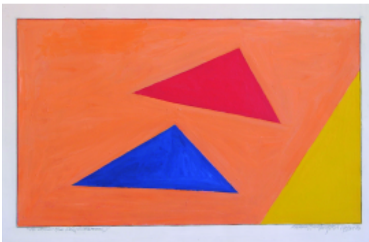
On Comes the Don (Giovanni) , 1973 + 1993, acrylic on paper, 25 x 33 in.

Toward the end of the 1960s, Huntington began working on large format canvases pieced together with a central canvas framed by adjoined, upward-facing U-shaped canvases. The image in these