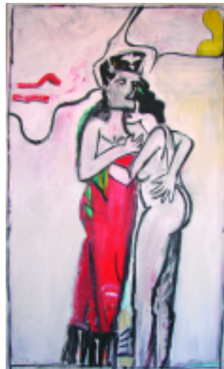
Mussolini in Love , 2008, oil on canvas, 70½ x 48 in.